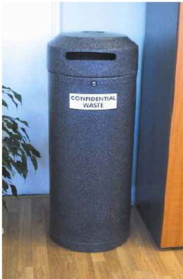
MI4 Continental Confi Bin – 52L Polyethylene body & galvanised steel liner