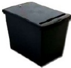
Personal Security Container – 34L designed for under-desk