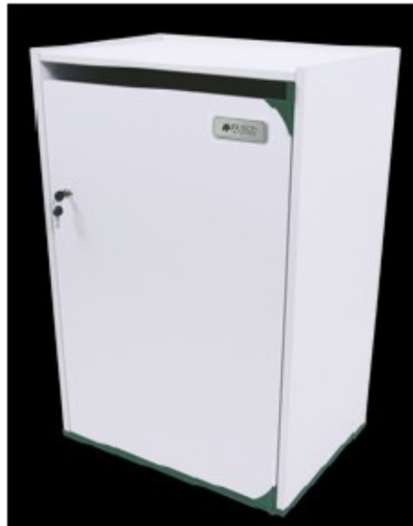
Duraflex Confi Cabinet – 40L Polyethylene with 25% recycled content