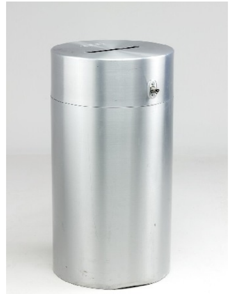
New Brussels Confidential Bin – 87L Made from brushed and lacquered aluminium