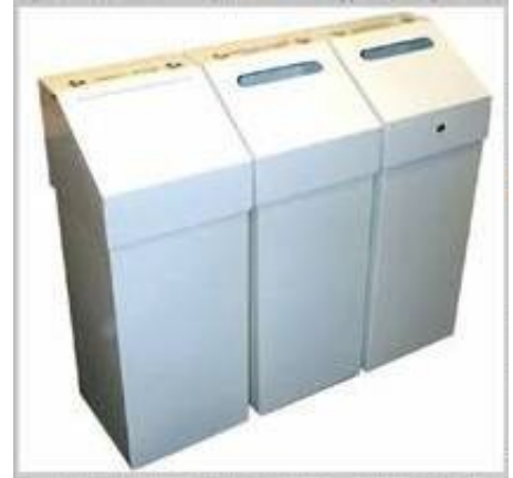
Zintec-SQ Confidential Bin – 60L Made from fire-resistant Zintec steel